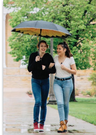
Walking Across Campus