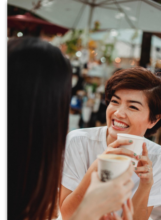
In Line at Starbucks