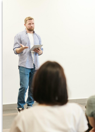
After the Lecture